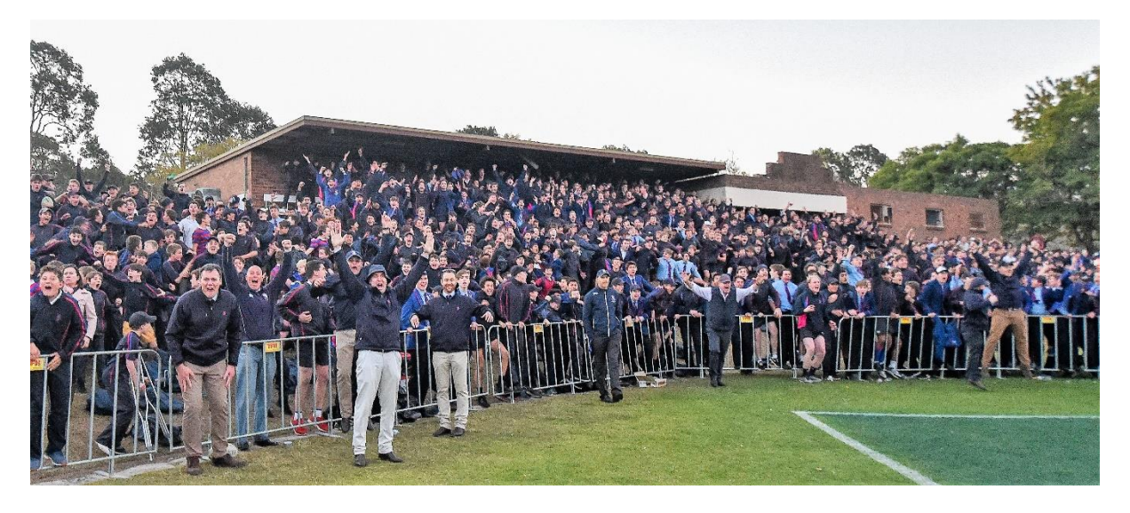
First XV after their victory which secured the 55<sup>th</sup> First XV GPS premiership for the College.

The student body when Joeys scored the winning try. The support of the boys was magnificent all year and they kept going right to the very end.