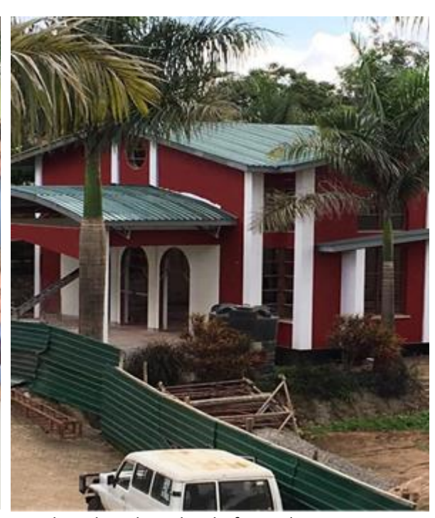
Chapel at The School of St Jude, Tanzania